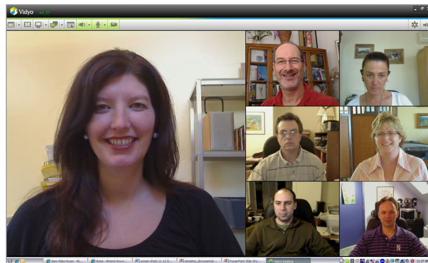
▲ VidyoDesktop application included with VidyoOne.

When a user attempts to access VidyoConferencing for the first time from a Windows PC or Mac via the VidyoOne™ portal, the VidyoDesktop™ client software automatically downloads and installs on the user's computer. The VidyoDesktop provides features such as application-sharing and "continuous presence or voice-activated speaker" window, plus a variety of camera and audio controls. All provisioned users have access to their own, reservation-less, virtual meeting room with access controls and the ability to invite guest users as well as other provisioned users. Want to add room systems to your VidyoOne solution? No problem – all of the VidyoRoom models integrate with the VidyoDesktop and each other seamlessly in a blended environment. What's more, VidyoRooms and VidyoGateways do not consume concurrent use software licenses called VidyoLines, making it the most cost effective multipoint platform for room systems available in the market today and leaving all of your VidyoLine capacity available for your VidyoDesktop endpoints.